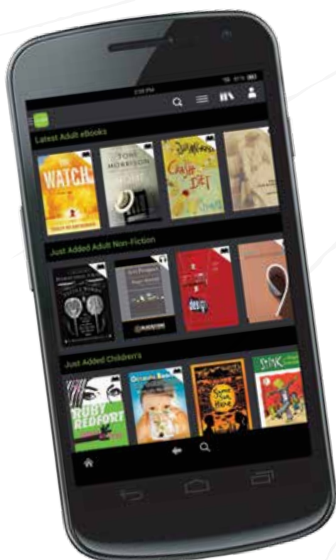
▲ AXIS 360 APP