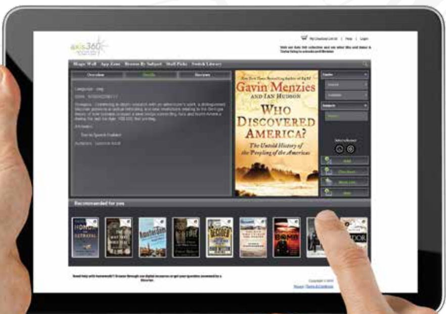
▲ TITLE PAGE